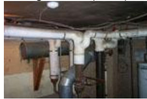
Asbestos pipe insulation in basement of residence.

Asbestos is a plentiful, readily available & low in cost mineral fiber. It has been used in thousands of building materials due to its high tensile strength, fire retardant characteristics and poor heat electrical conductivity. Due to these dynamic physical properties, asbestos is commonly found in fireproofing materials, and is also added to a variety of building materials to increase strength. The three categories of Asbestos-Containing Building Materials (ACBM) are: