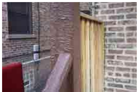
Lead paint chipping on exterior porch

Lead is primarily found in the exterior and interior paint of the building. Lead was added to paint for three main reasons: Color Enhancement, Increased Durability & as a Drying Agent. Lead-based paint is typically found in window systems, bathrooms, door jambs, soffits, chair rails and doors.